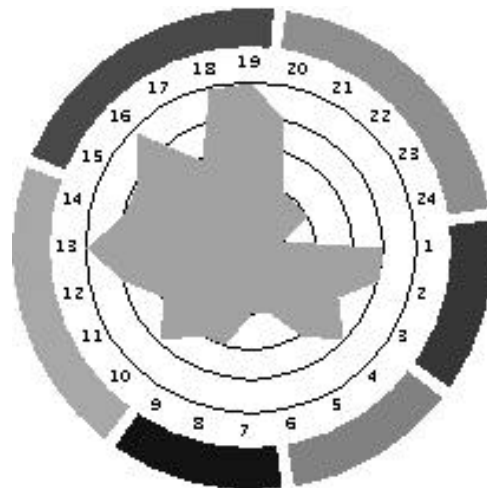
Figure 2 Profiler Radial Graph

Each individual's submission is displayed on a radial graph (Figure 2), along with a companion graph for the group averages. The sections around the border indicate groups of questions defined by the survey authors. The graph as displayed by the Profiler server is "hot": moving the mouse over a question displays the item and the respondent's score.