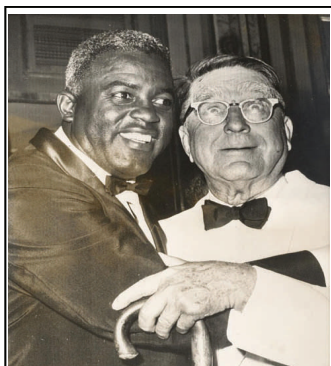
July 1962– Jackie Robinson & Branch Rickey reunited as Robinson is inducted into baseball’s Hall of Fame.

Robinson’s and Rickey’s courage provided not only an appropriate way to celebrate the work of Martin Luther King, but also proved to be a provocative backdrop for the historical inauguration of the nation’s first African-American president.