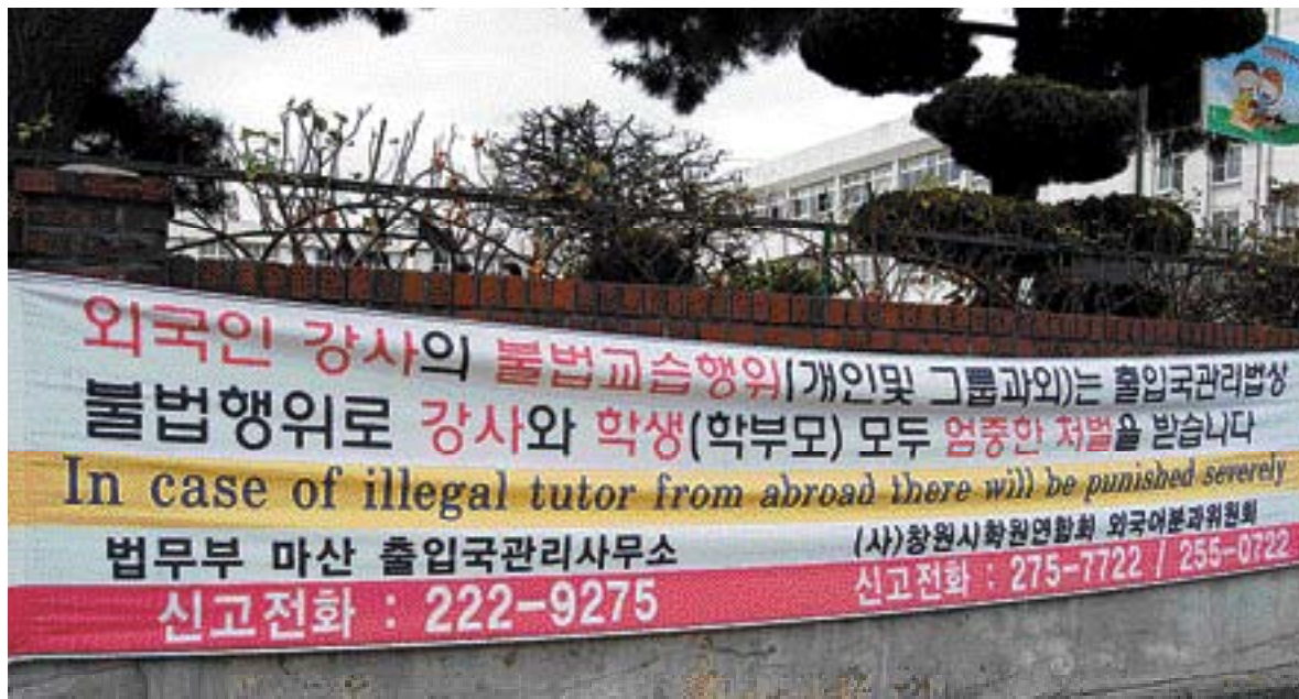
A banner at a primary school in Changwon, South Korea, warns foreign teachers not to work illegally

"Teachers wanting to go to Korea for the first time will be turned off," said